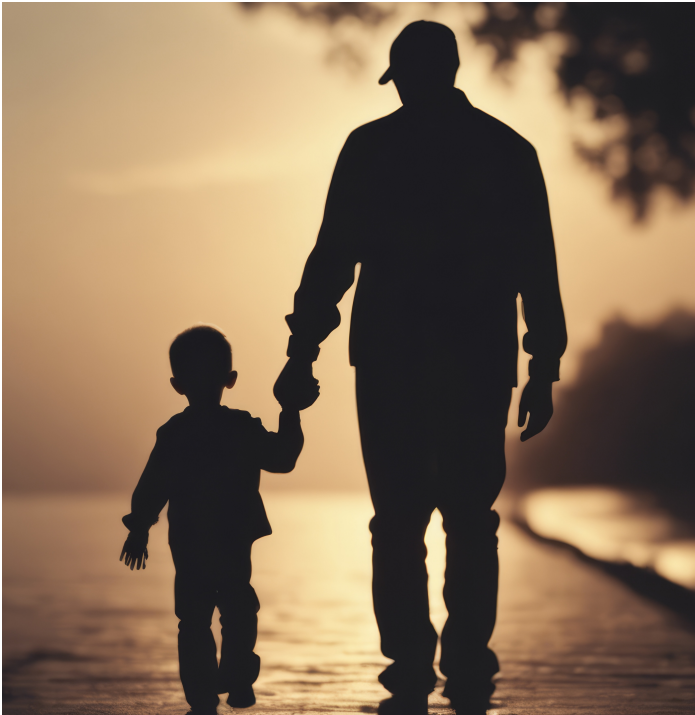
Bible verses for Father's Day.

As we reflect on Father's Day, it's meaningful to remember its spiritual roots. The holiday is often credited to Sonora Smart Dodd, whose deep faith and gratitude for her widowed father raising six children alone on a farm, inspired her to advocate for a day that honours fathers through recognition and prayer.